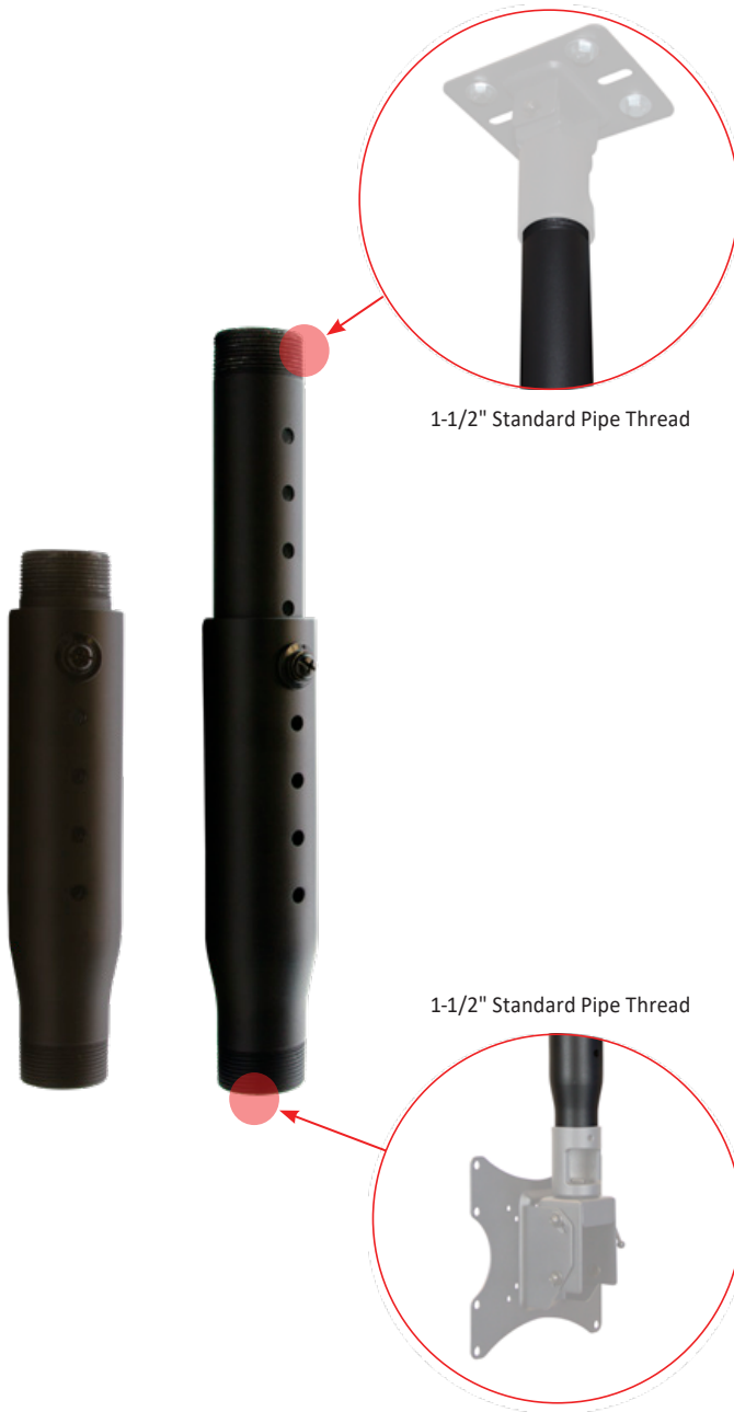
1-1/2" Standard Pipe Thread