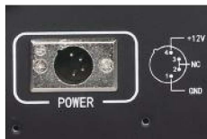
XLR Power Interface