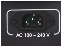
AC 100~240V Power Interface