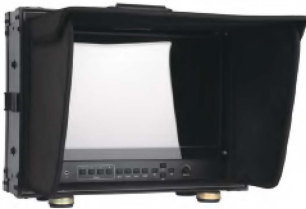
A: Engineering aluminum Case + Sun-Hood