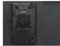
V-mount battery plate