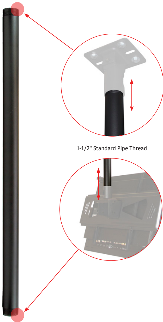
1-1/2" Standard Pipe Thread